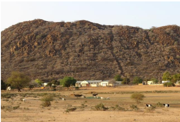
The hills of Shoshong

Since the Matabele to the north were pretty unfriendly neighbors at the time, the hills were a welcome shield. Sekgoma I made it his capital in 1849. His son, Khama III, consolidated and built Shoshong into a strategic center of around 30,000 people.