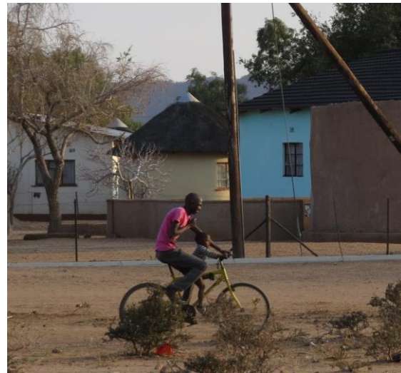
Learning to drive in Shoshong