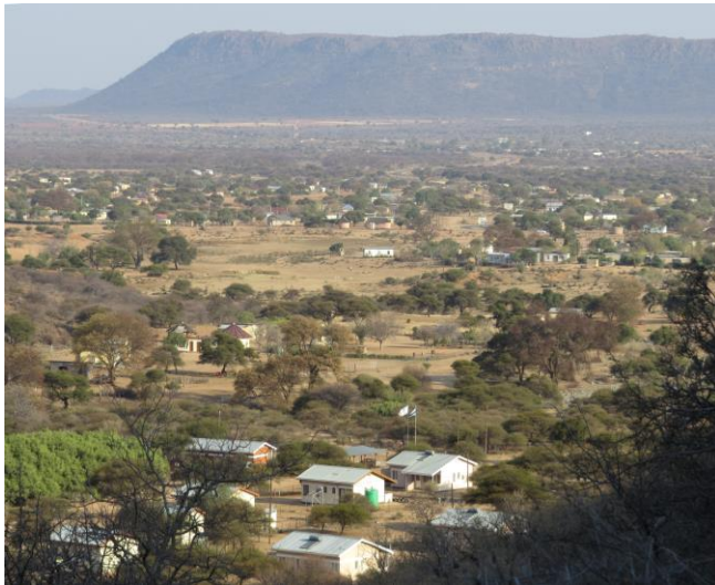
Looking down on Shoshong from the hills